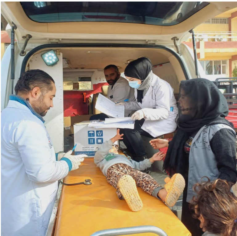
Staff members examine a young patient at a mobile medical unit in northern Syria.

Over the past two weeks, hostilities in northeast Syria, particularly in eastern Al-Hasakeh, Aleppo and Al-Raqqah, have escalated. Two car bombings in Menbij killed 24 civilians, including women and children, and injured several others. Fighting near the damaged Tishreen Dam has left 410,000 people without water and electricity for more than eight weeks.