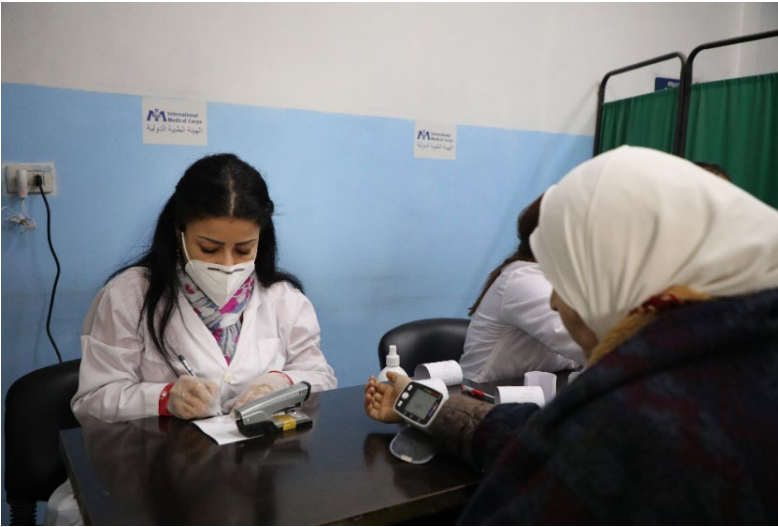
A nurse provides an examination to a woman at an International Medical Corps-supported primary health center in Jaramana, Damascus.

Since the fall of President Bashar al-Assad on December 8, Syria has experienced profound political and security transformations. Ahmed al-Sharaa has assumed leadership, implementing decrees mandating the disarmament of all armed groups to restore central state control. This policy seeks to reestablish authority and promote stability nationwide. However, widespread hostilities persist, particularly in Aleppo, Deir-ez-Zor and Tartous, significantly impeding recovery efforts.