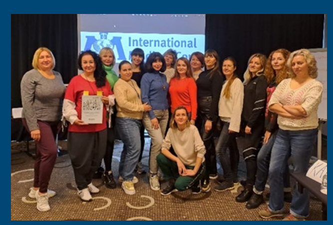
International Medical Corps Self-Help (SH+) training in Krakow, Poland, from October 20–22.

In October/November 2023, International Medical Corps' Poland team continued its efforts supporting war-affected and vulnerable populations. The team: