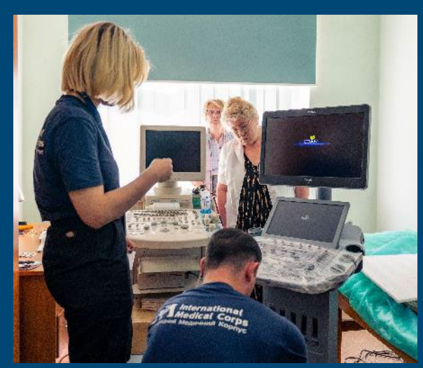
Members of International Medical Corps' Health team set up medical equipment in one of the healthcare facilities that we support in Mykolaivska oblast.