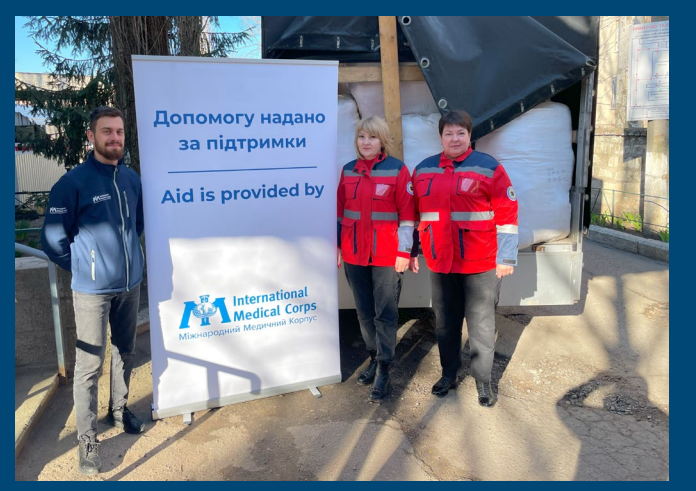
International Medical Corps Health team distributes medical commodities in one of the healthcare facilities in Mykolaivska oblast that we support.