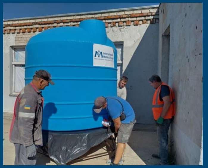
International Medical Corps staff members distribute water tanks for use by affected populations in north Kherson..