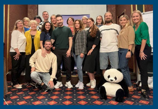
Participants in the Mental Health Case Management training session, held in Kyiv city.

In September, MHPSS team delivered sessions to support war-affected populations, including both local communities and internally displaced persons (IDPs), including the following: