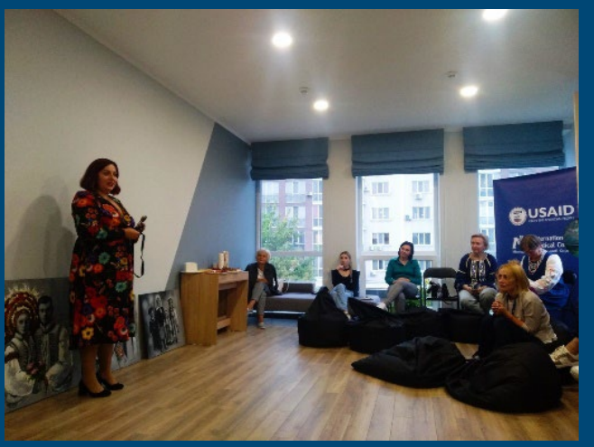
A woman performs at the musical poetical evening "Women's Voices," which we held in the Irpin WGSS, Kyivska oblast.

During September, International Medical Corps' GBV team kept providing prevention and response services directly and through local women's rights organization (WRO) partners. The team: