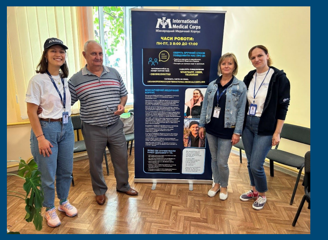
International Medical Corps staff members implement a cash for health program in Mykolaiv.

In September, the Cash team continued to support vulnerable populations with cash. The team: