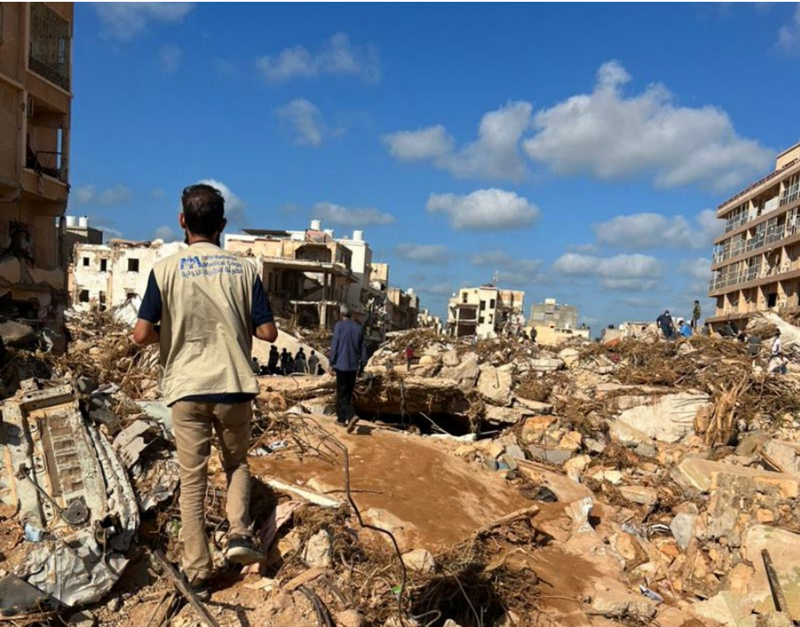
International Medical Corps teams are on the ground in Derna, providing aid.

On September 10, a powerful “medicane” dubbed Storm Daniel made landfall in Libya, bringing strong winds and such heavy rainfall to northeastern areas of the country that two dams upstream of the coastal city of Derna collapsed the next day. The breach and resulting floodwaters had catastrophic consequences for the city’s people and infrastructure.