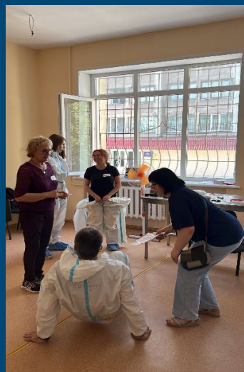
International Medical Corps staff and HHI volunteers conduct Phase 3 of Emergency and Trauma Care Training for instructors across Ukraine.

In August, International Medical Corps' Training team launched Phase 3 of the Emergency and Trauma Care Training project, in partnership with the Harvard Humanitarian Initiative (HHI). Medical providers* from across Ukraine convened at Dnipro State Medical University, where they attended the following courses: Trauma Nursing Fundamentals (17 participants); Chemical, Biological, Radiological, Nuclear and Explosives (28 participants); Stop the Bleed (45 participants); and Stop the Bleed for Instructors (13 participants).