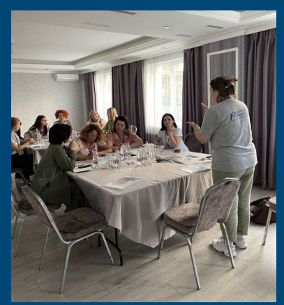
An International Medical Corps' GBV team member conducts Case Management training in Odesa.

During August, International Medical Corps provided GBV prevention and response services directly and through local women's rights organization (WRO) partners. The team also: