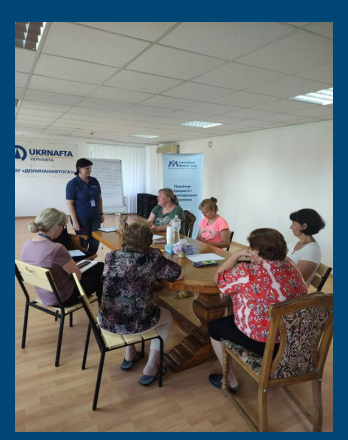
Above: International Medical Corps' MHPSS team delivers an Active Longevity session at an IDP center

Below: Recreational activity for peer-support sessions arranged by International Medical Corps in Chernihivska oblast