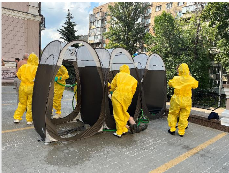
As part of the Trauma Care Response training program developed in partnership with HHI, CBRNE training participants simulate decontamination of patients using shower tents and hoses.

Ukrainian forces recently have made limited gains in the southwest of the country, in and around the city of Kherson, as well as retaking some villages to the north of the city, disrupting Russian supply lines and destroying ammunition supplies. Russian forces have started to make some gains in the southeast of the country, where they are attempting to expand into the Donetsk oblast after securing the Luhansk oblast at the end of June. There also have been some limited redeployments of Russian forces in an effort to strengthen areas long the central-southern conflict lines, to ensure there will be no Ukrainian gains in and around Kherson. Missile, rocket and artillery attacks by Russian forces continue against Mykolaiv in the southwest and Kharkiv in the eastern-central part of the country, with civilian casualties mounting on a daily basis, and increased attacks by Russians against the towns and villages in the southeast of the country. Russian forces are assembling to the east of Kharkiv, which could indicate a renewed offensive but also could be an effort to ensure that Ukrainian forces cannot counterattack and push toward the border.