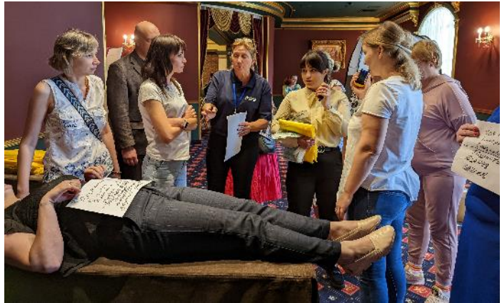
Participants in CBRNE training break into “skills stations” to practice management of disaster scenarios.

The first course—which focuses on chemical, biological, radiological, nuclear and explosive (CBRNE) threats—provides participants with the knowledge and skills to care for victims of CBRNE attacks in pre-hospital and hospital settings, including training on decontamination, medical management, antidotes, PPE donning/doffing and medical staff safety. The CBRNE course, which was delivered to two cohorts and included separate sessions of training-of-trainer certification, reached 119 participants. The second course, Mass Casualty Management (MCM)—a comprehensive, four-day course based on World Health Organization/Pan American Health Organization standards—focuses on mass-casualty incident training at the individual level while also covering the logistical setup of healthcare facilities and the creation of mass-casualty plans at the facility and organizational level. The course reached 11 participants from four health facilities. The third course, Stop the Bleed, teaches bystanders how help people who are bleeding if medical professionals have not yet arrived. The course, which was delivered to two separate cohorts, reached 70 participants. The next three courses will be delivered later in August, with subsequent trainings continuing for 10 weeks.