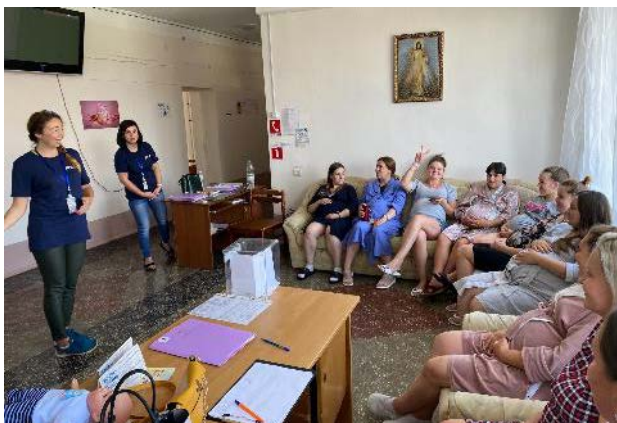
International Medical Corps' Nutrition team discusses the benefits of exclusive breastfeeding with pregnant mothers at the Maternity Hospital in Stryi during World Breastfeeding Week.